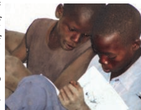
MOST BOYS AND ALMOST ALL GIRLS DO NOT KNOW HOW TO READ, BUT ARE EAGER TO LEARN

Our vision is to begin with 30 to 50 children of approximately 7 years of age, and then to build into their lives right through to adulthood with a comprehensive package of beliefs, attitudes, and conduct which befit a Kwong society ordered by Christ. In this “school of character”, nothing would be outside the scope of its teaching – the practice of polite behavior, the valorization of sacrificial service to others, healthful living, God-honoring marriage, the practice of personal discipline, an awareness of the outside world, an appreciation of nature, the pursuit of academic excellence, love for and devotion to Christ, and finally (and most crucially), a sense of obligation to imbue their own children with